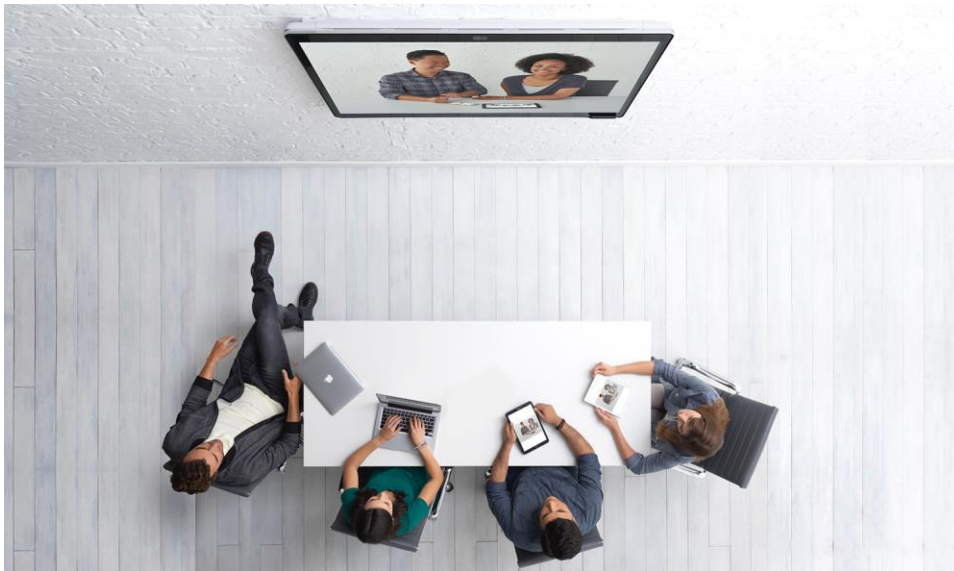
Figure 2. Video Conferencing on the Cisco Spark Board

The Cisco Spark Board is the latest addition to the portfolio of Cisco Spark video and audio conferencing devices that register to the Cisco Collaboration Cloud, including the Cisco TelePresence® MX and SX Series, the DX Series, the Cisco IP Phone 7800 and 8800 Series, and the Cisco Spark Room Kit Series .