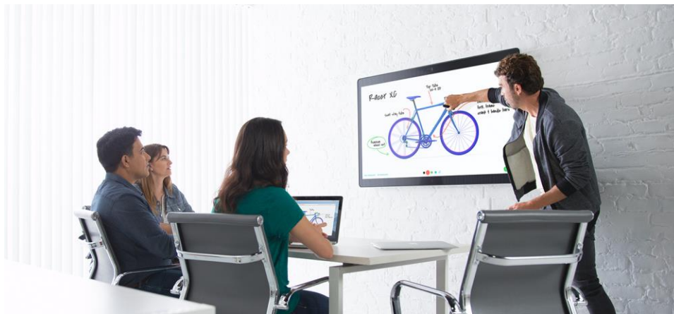
Figure 1. White Boarding Capability on the Cisco Spark Board 55

The Cisco Spark™ Board is an all-in-one device that provides everything you need to collaborate with your teams in physical meeting rooms. You can wirelessly present, white board, and have video and audio calls. And it securely connects to your virtual teams through the Cisco Spark service, via your Cisco Spark app-enabled devices, so you can take your meetings and content on the road.